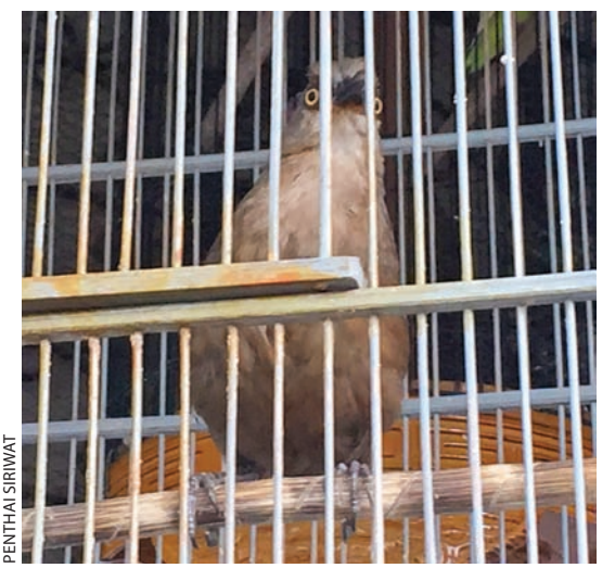
Plate 3 . Rufous-fronted Laughingthrush Garrulax rufifrons , August 2016.

to Critically Endangered, primarily due to heavy trapping pressures. Population estimates are at best guesstimates, but BirdLife International (2016d) suggested less than 250 mature individuals, based on the highly restricted distribution and lack of recent records, including surveys of markets throughout Java. The species is not protected under Indonesian law.