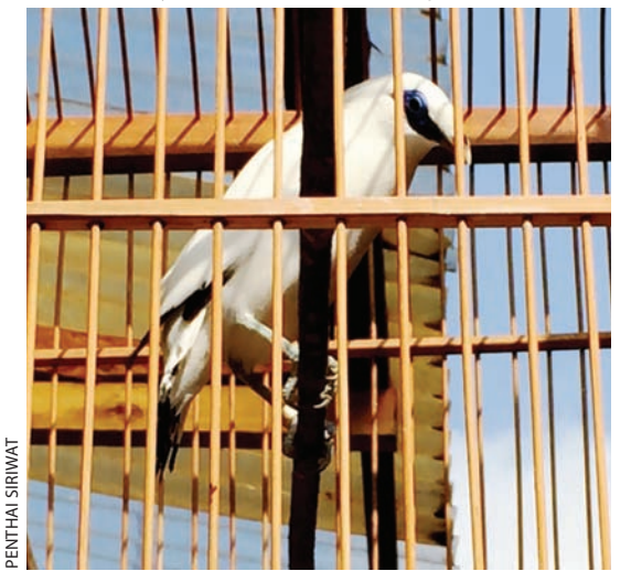
Plate 2. Bali Myna Leucopsar rothschildi, August 2016.