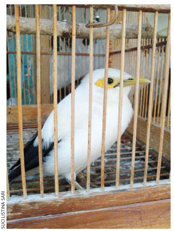
Plate 1. Black-winged Myna Acridotheres melanopterus , August 2016.