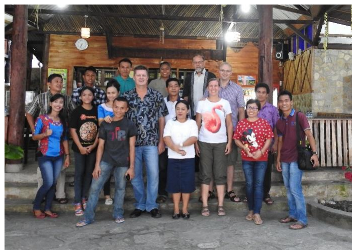
Team of the Nias Heritage Museum