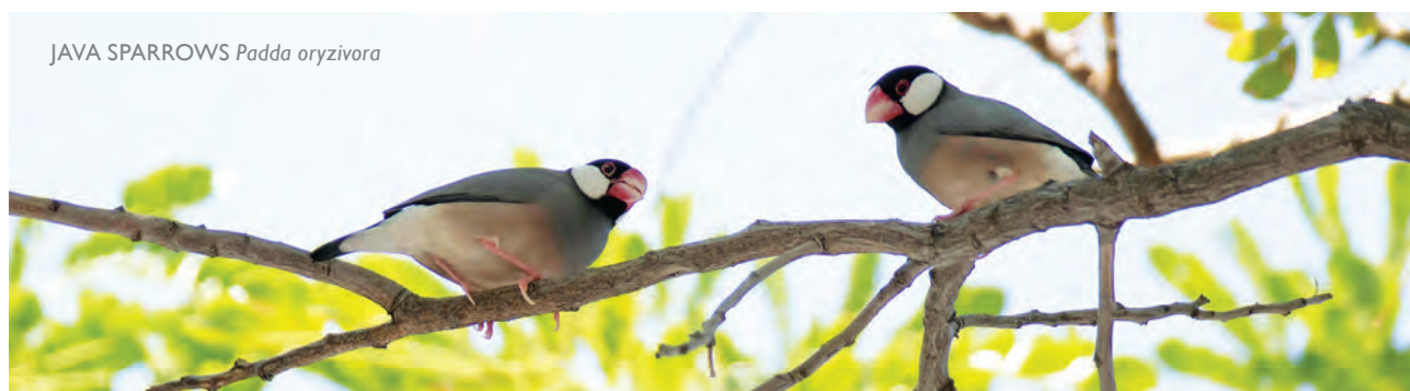
JAVA SPARROWS Padda oryzivora

..... SEVERAL TRADERS SAID THAT THE BIRDS WERE ACQUIRED FROM FORESTS IN WEST SUMATRA, NORTH SUMATRA AND ACEH, A FACT CORROBORATED BY A LOCAL BIRD GUIDE, WHO STATED THAT TRAPPING WAS RIFE IN ACEH'S FORESTS.