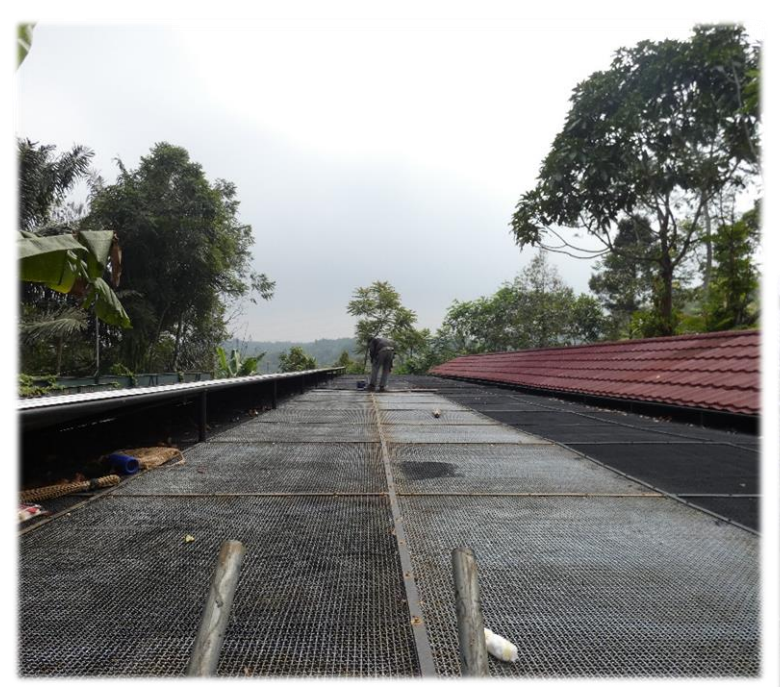
Final section of roof to paint