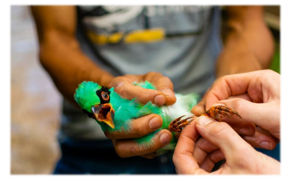
Ringing one of the chicks

Whilst captive breeding of the birds at CCBC is taking, what we hope is a brief, hiatus until the effects of CoVID-19 are not felt as strongly and/or we reach a more financially stable time, we can update you on the Javan Green Magpies bred in the previous breeding season. The seven chicks reported on in the previous edition have now all be removed from their parents and live in a sibling pair or singularly. We have DNA sexed all individuals from feather samples and subsequently know we have a ratio of two males and five females from these chicks.