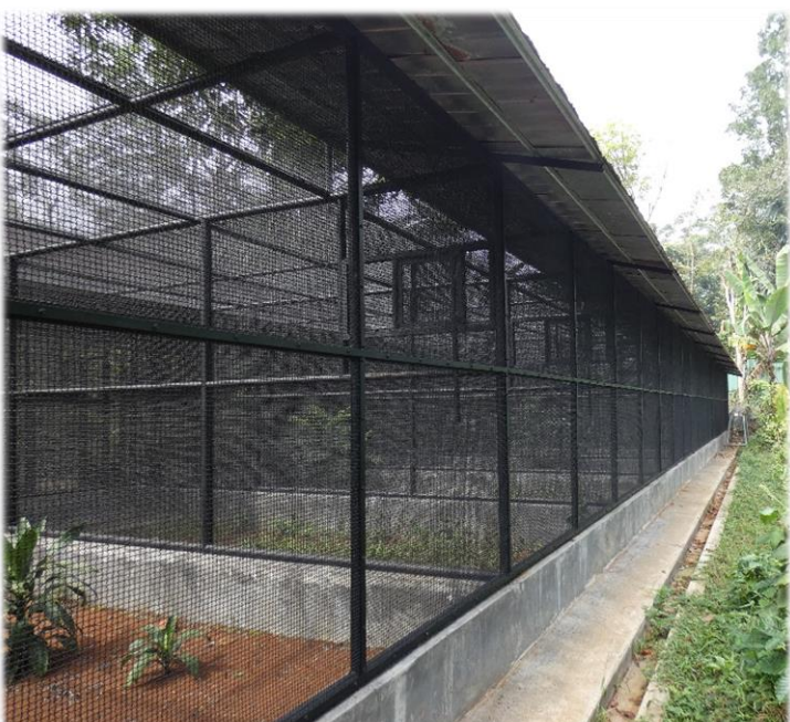
Outward facing side of larger breeding aviaries