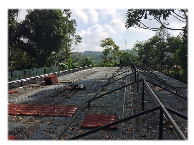
Mesh fitted and roof structure in place