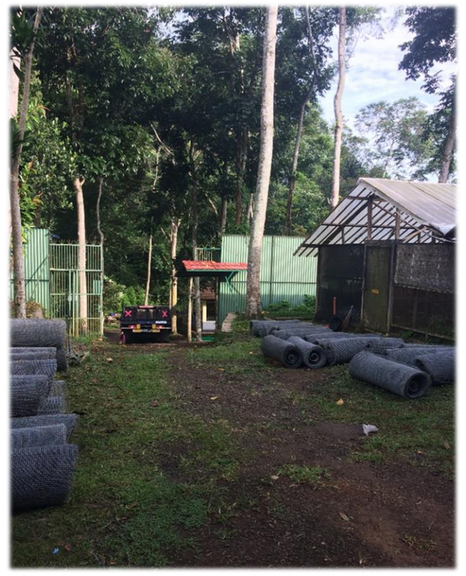
The day we had all been waiting for, mesh arrival!

In what has felt like a never-ending project due to mesh production issues, travel restrictions and everything else in between, we narrowly edge closer to a finished aviary block! Since our last update on this build in edition 16, all remaining mesh arrived and has now been fitted, aviary roofs are installed and the final coat of paint inside the aviaries is currently going on! In preparation for birds going into the aviaries we have recently cut back much foliage from surrounding trees to maximize sunlight reaching the aviaries intended for the Black-winged Myna and will now start planting up finished aviaries with trees and plants and preparing for the installation of nest site CCTV. It is important we have birds moved and established in these cages before the rains start as this is the breeding season for the Javan Green Magpie and Rufous-fronted Laughingthrush. The Rufous-fronted Laughingthrush is still a difficult species to breed in captivity and it is the hope this aviary design will help us to understand their requirements better. In our next update we hope our patience on this build, which has now been incomplete for over a year, has been rewarded!