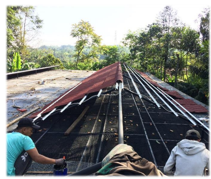
Roof and paint going on