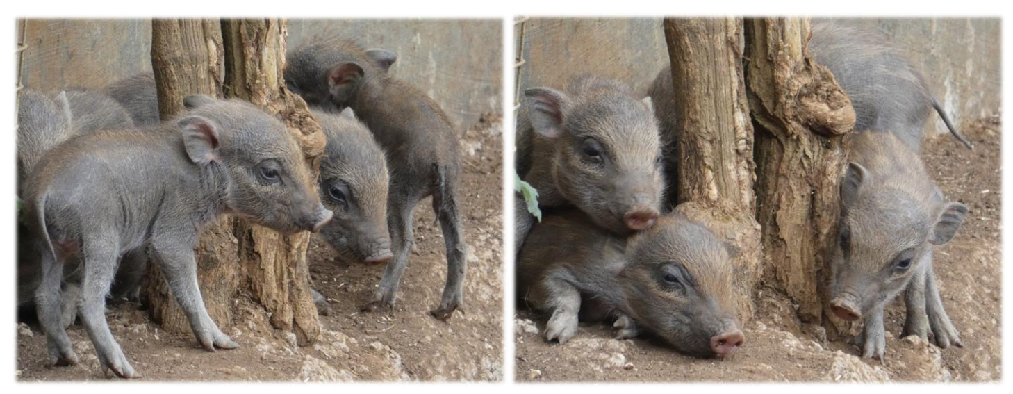
You can always rely on piglets to lift the spirits! Litter at one week old.

Within weeks of the translocation of pigs to Batu Secret Zoo we welcomed a litter of five piglets from our most consistent breeding pair, Rimba and Seni. All pigs initially looked healthy, although slightly on the small side, Seni however obviously knew something we did not about one of the piglets as at just over a week after birth there was only four piglets one morning and it was not possible that it could have escaped. Seni continues rearing four piglets that are developing well and are already very mobile! We always want to promote breeding that maximizes genetic diversity in our local population so a litter from a consistent breeding pair may not immediately seem a huge success, however these results enable us to contribute to conservation efforts such as the program at Baluran National Park without detrimentally affecting the genetic diversity of our local population.