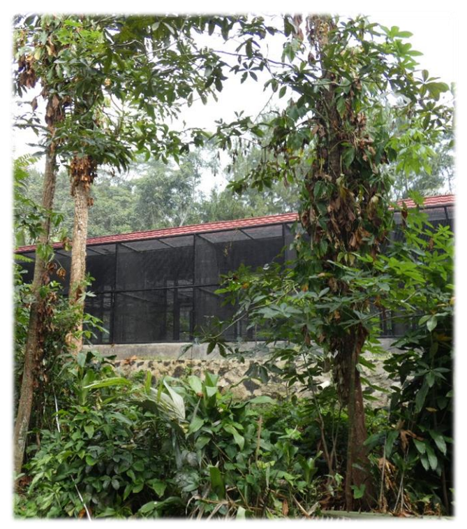
Outward facing side of smaller breeding aviaries