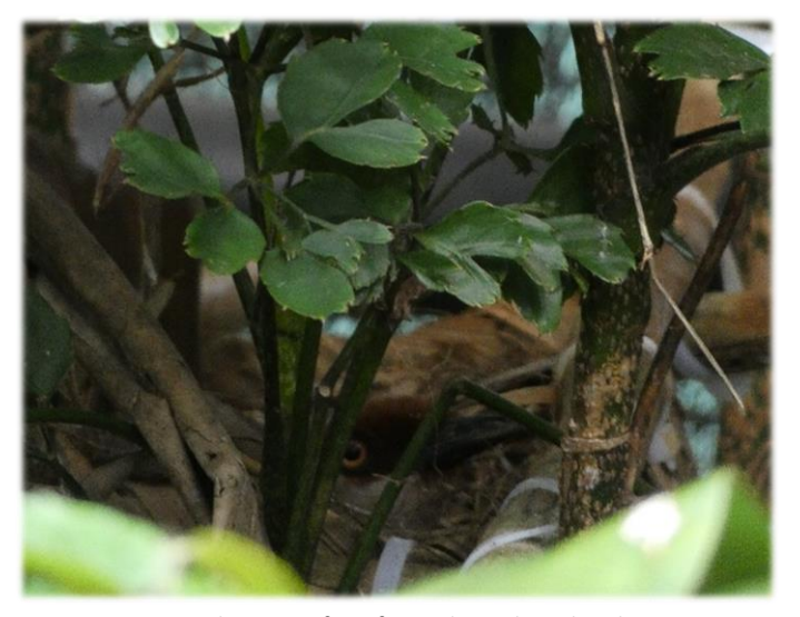
Incubating Rufous-fronted Laughingthrush

Centre wide, breeding efforts have been continued with these two species. The increased capacity new aviaries affords us in turn means we can house breeding pairs further apart, something we suspect is increasingly important for the successful breeding of the Rufous-fronted Laughingthrush.