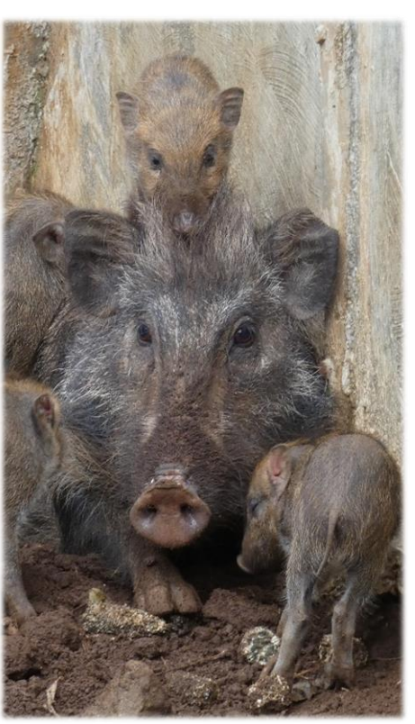
No rest for a new Mum!