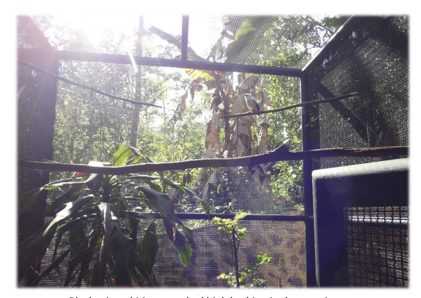
Black-winged Myna perched high bathing in the morning sun

As we come to the end of 2020, a year that played out likely beyond most of our wildest imaginations, CCBC, despite not having progressed many aims for the year, is in a position of stability. For this we extend our gratitude to all of our sponsors, new and long-term, for your commitment to our cause in the face of a global pandemic which undoubtedly affected all of your institutions. Your continued support has allowed us to retain a full complement of locally employed staff without any salary cuts and maintain our local populations of Endangered and Critically Endangered species to a high standard. As we look ahead to the New Year, and what is hopefully a new chapter, we still have positive news to share before we bid a timely farewell to 2020!