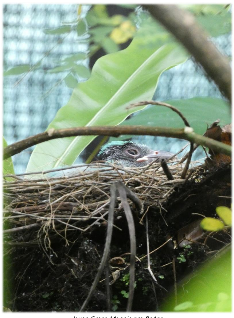
Javan Green Magpie pre-fledge

Due to the uncertain nature of 2020, it was initially decided to halt breeding at CCBC so as not to incur increased costs. Thankfully new funding was found and we have continued breeding efforts, albeit at a reduced intensity, with more of a focus on specific pairings of the Javan Green Magpie and Rufous-fronted Laughingthrush. With the completion of PKB UP just as the rains started, we were able to move breeding pairs into these aviaries straight away. The new aviaries are isolated and set away from human disturbance and almost immediately we saw positive breeding behaviour from a priority breeding pair of Javan Green Magpie and Rufous-fronted Laughingthrush. The Javan Green Magpies, of which one individual has never bred before, we have confirmed have one chick which we expect to fledge on Christmas day. The Rufous-fronted Laughingthrush pair currently try a second clutch after a first attempt, which, for unknown reasons, failed. With the first clutch the pair did however sit for the entire incubation period and constructed a very good quality nest, so despite no chicks, we take a lot of positives from this and hope their second attempt is successful.