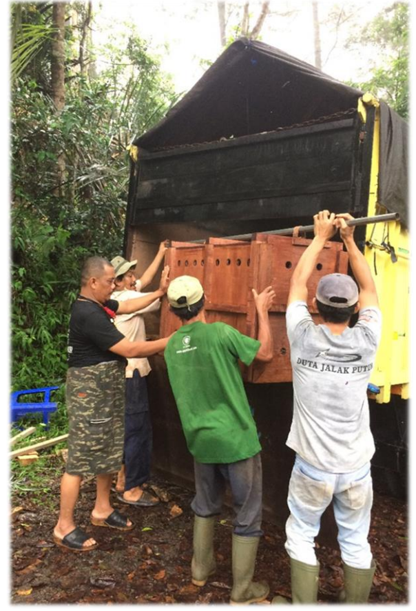
Last pig being loaded

In the last edition we shared plans for the translocation of five Javan Warty Pig to Baluran National Park to join the breed and release program there which aims to establish pig populations within the National Park. The paperwork thankfully progressed smoothly and we were able to realize these plans in the latter part of October, translocating three males and two females 30 hours by truck across Java! The pigs arrived in good health late at night and were immediately released into habituation enclosures. CCBC is very proud to be able to contribute to this project and to the in situ conservation of the Javan Warty Pig. This project is carried out by Baluran National Park in partnership with BKSDA (Indonesian Ministry Forestry Department) and Copenhagen Zoo. Other institutions who participated in this program by contributing Javan Warty Pig are Taman Safari Indonesia and Prigen Conservation Breeding Ark.