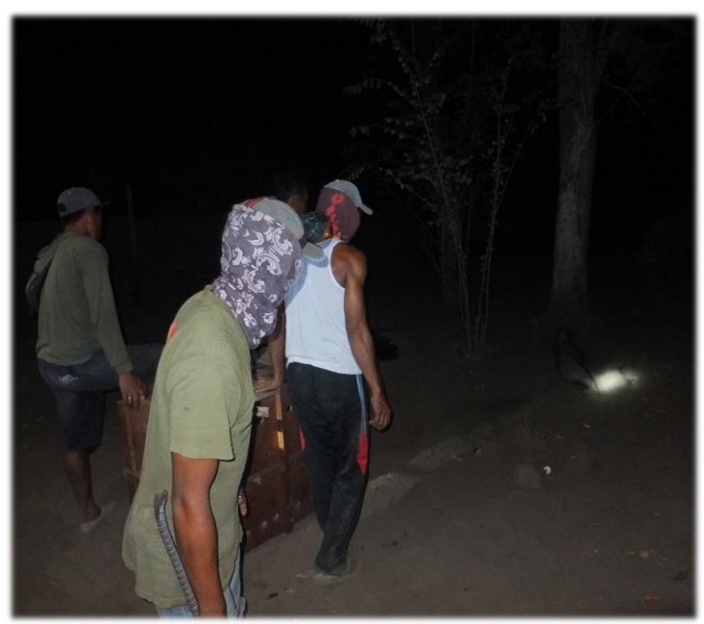
Blink and you will miss it! Baluran National Park tem unboxing pigs in habituation enclosure