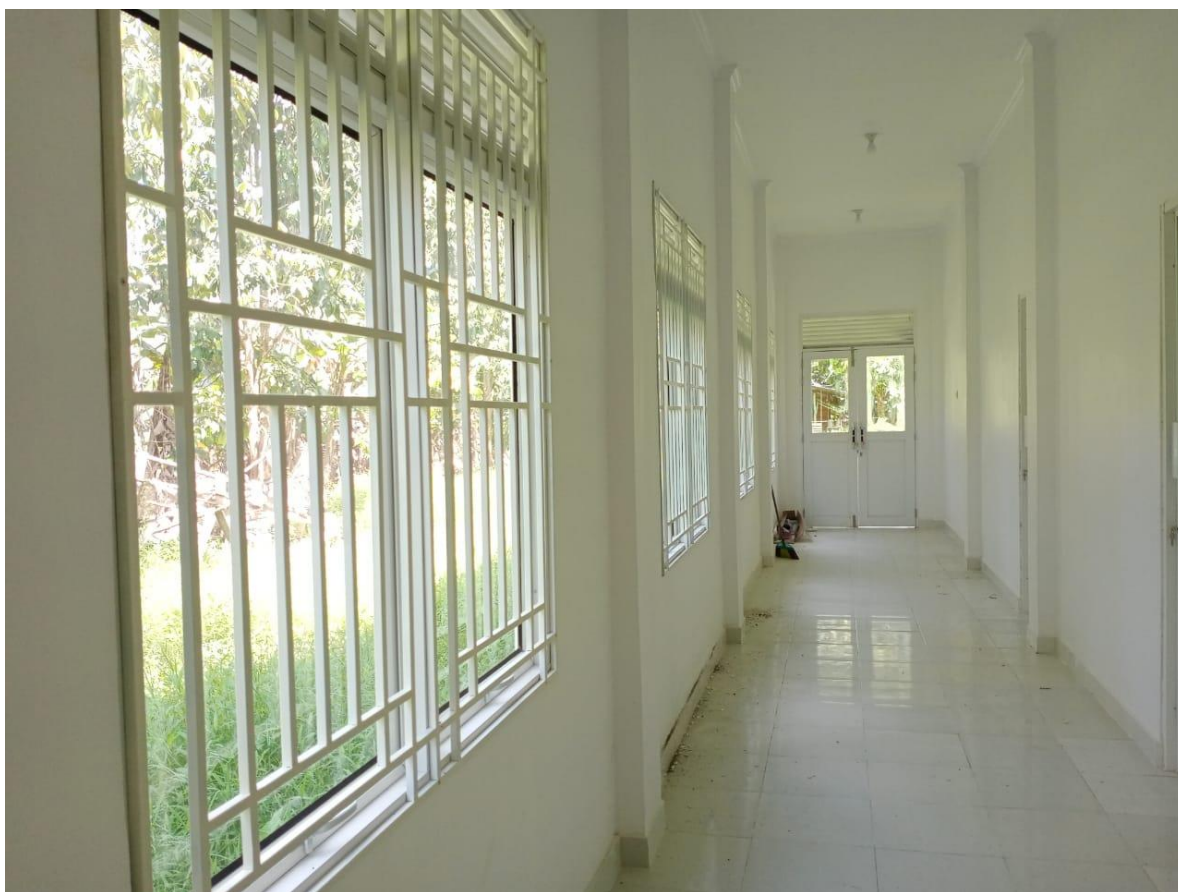
Fig. 2: Window safety bars installed in clinic building