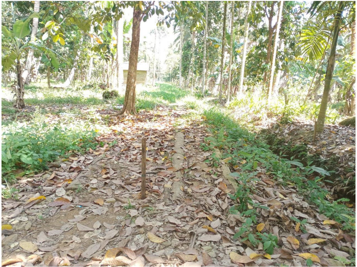
Fig. 5: Remodelling and rebuilding the access road