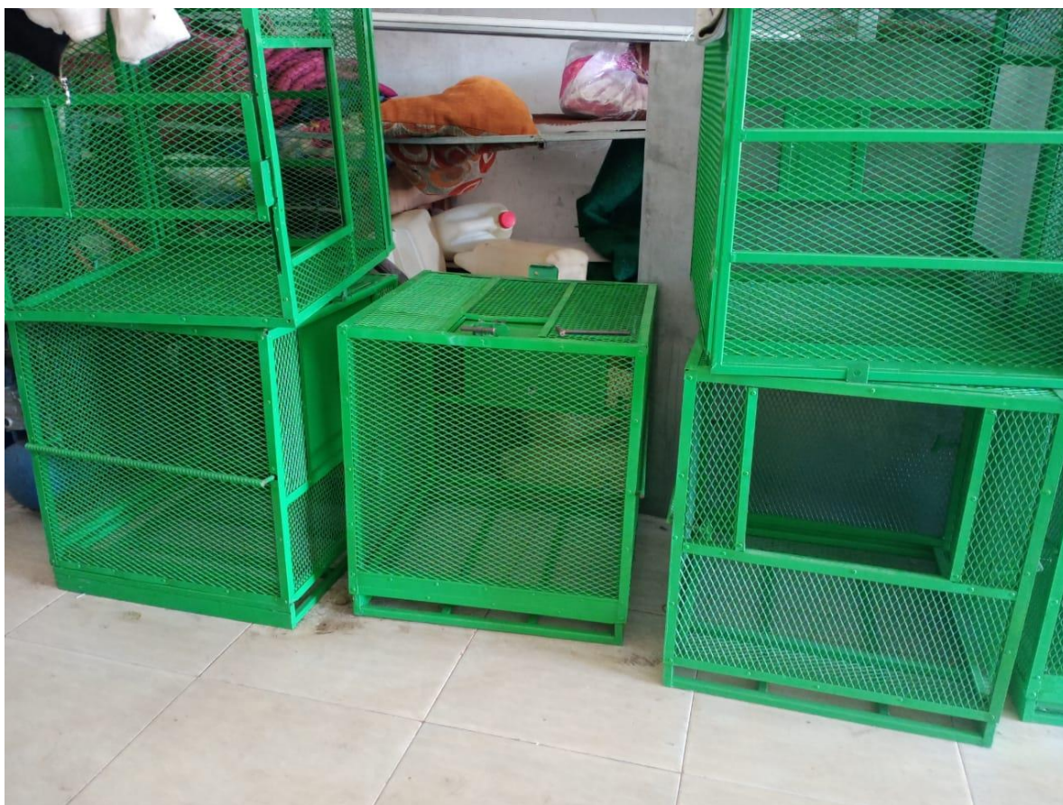
Fig. 4: Quarantine/Isolation cages.