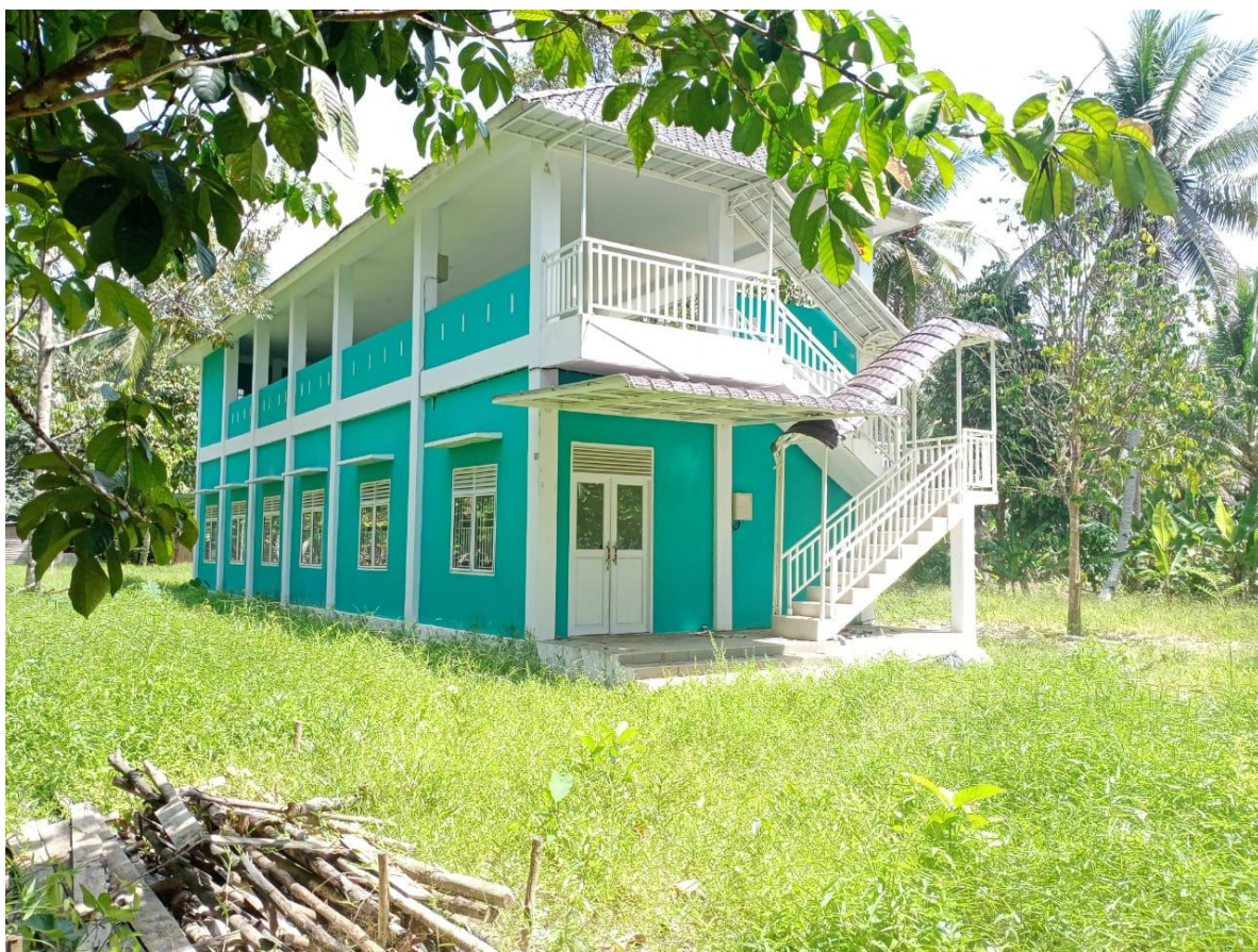
Fig. 1: Front side of the clinic building

Below a selection of pictures showing our completed and ongoing work to date: