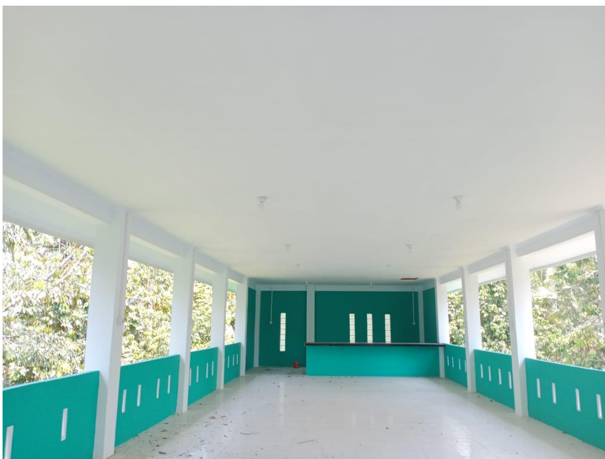
Fig. 3: Open workspace on top of the clinic