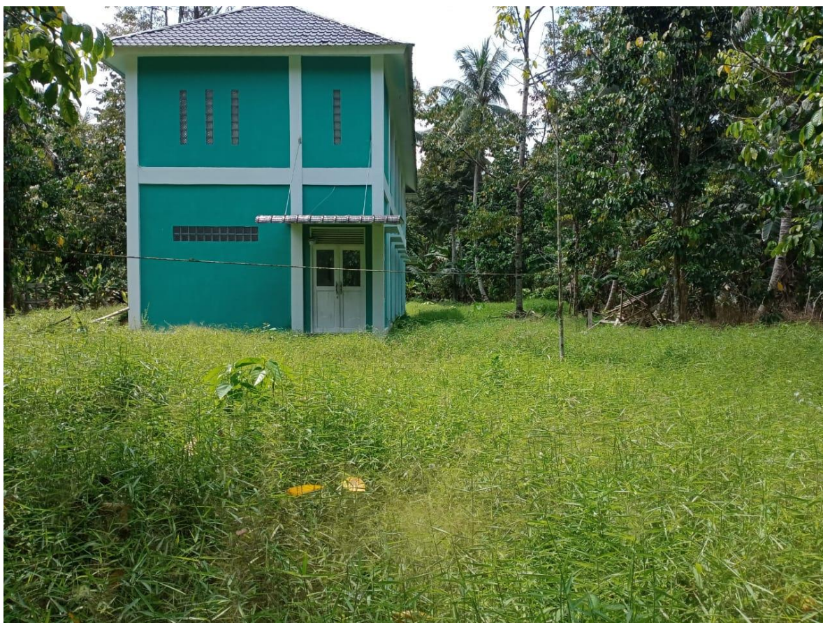
Fig. 7: Backside of the Clinic: The Quarantine area will be built (approx.) 20 meters distance from the Clinic building, entirely fenced with only one entrance