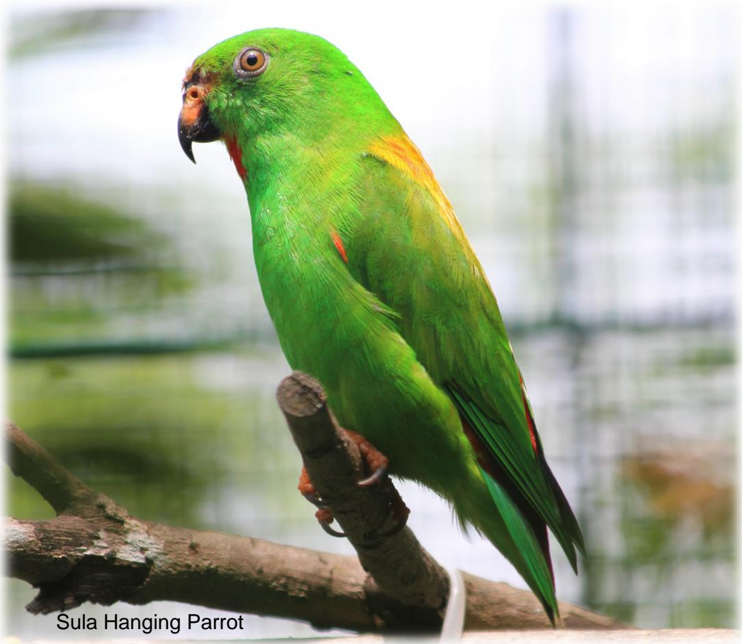
Sula Hanging Parrot

At the same time we recorded another fertile clutch of two eggs from one of our Lory pairs, unfortunately the embryos failed to fully develop. Nevertheless, the birds seem to make progress.