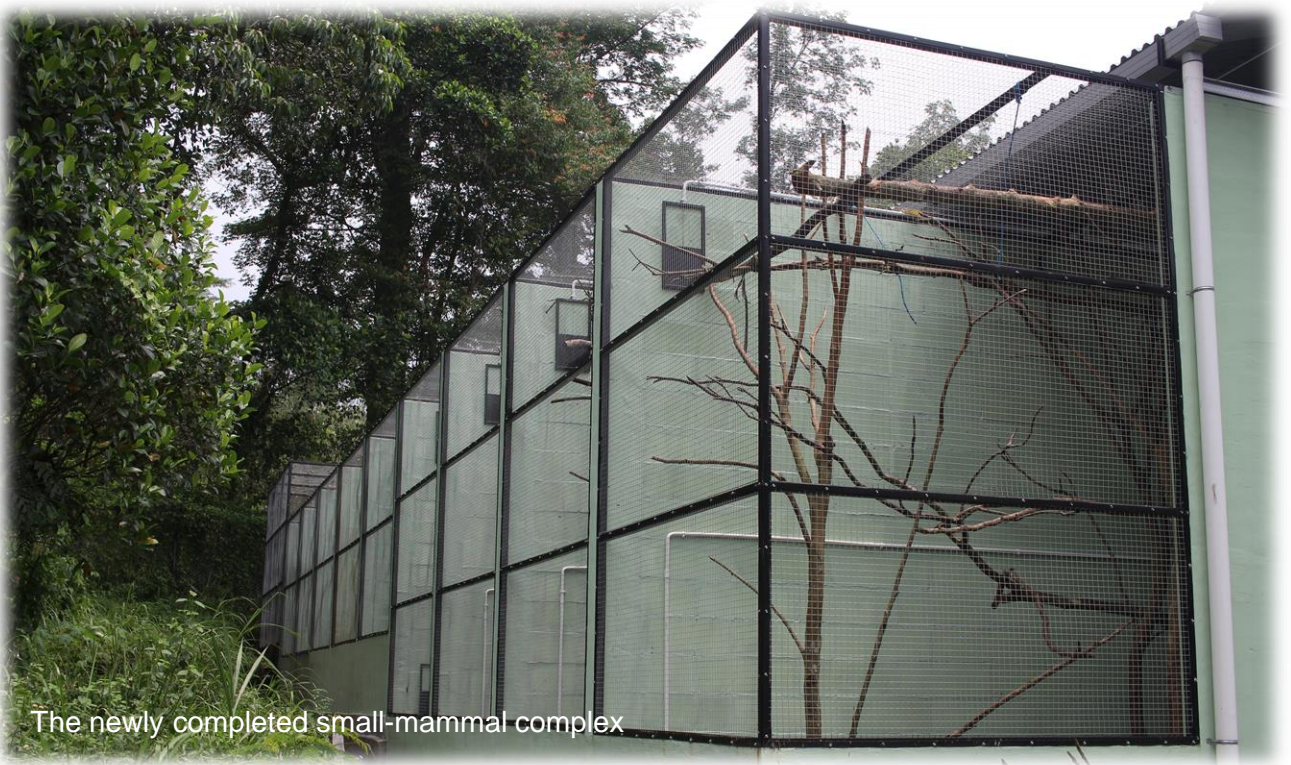
The newly completed small-mammal complex