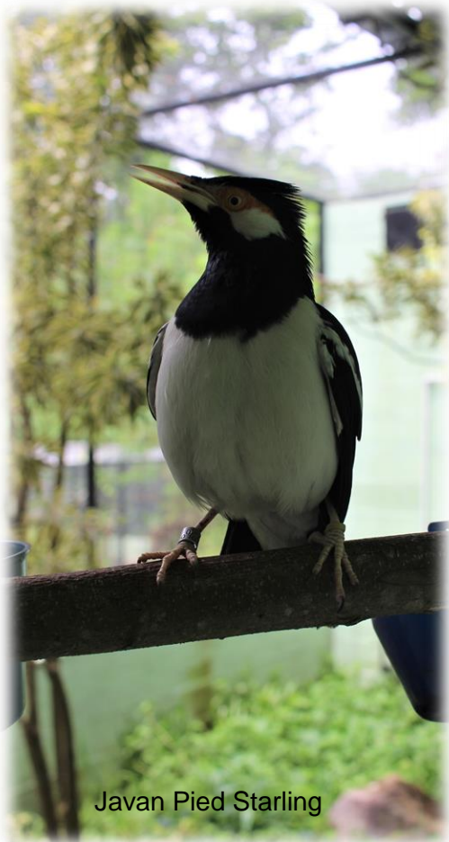
Javan Pied Starling

Successfully raised during the last three months: