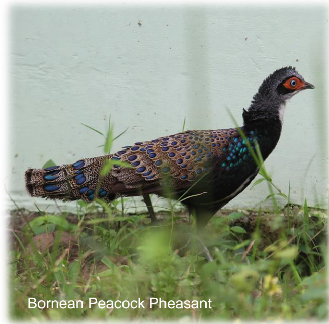
Bornean Peacock Pheasant

We were able to secure a pair of Salvadori's Pheasant ( Lophura inornata ) giving us the opportunity to gain expertise in caring for Lophura sp. which will be of great advantage once more threatened species become available.