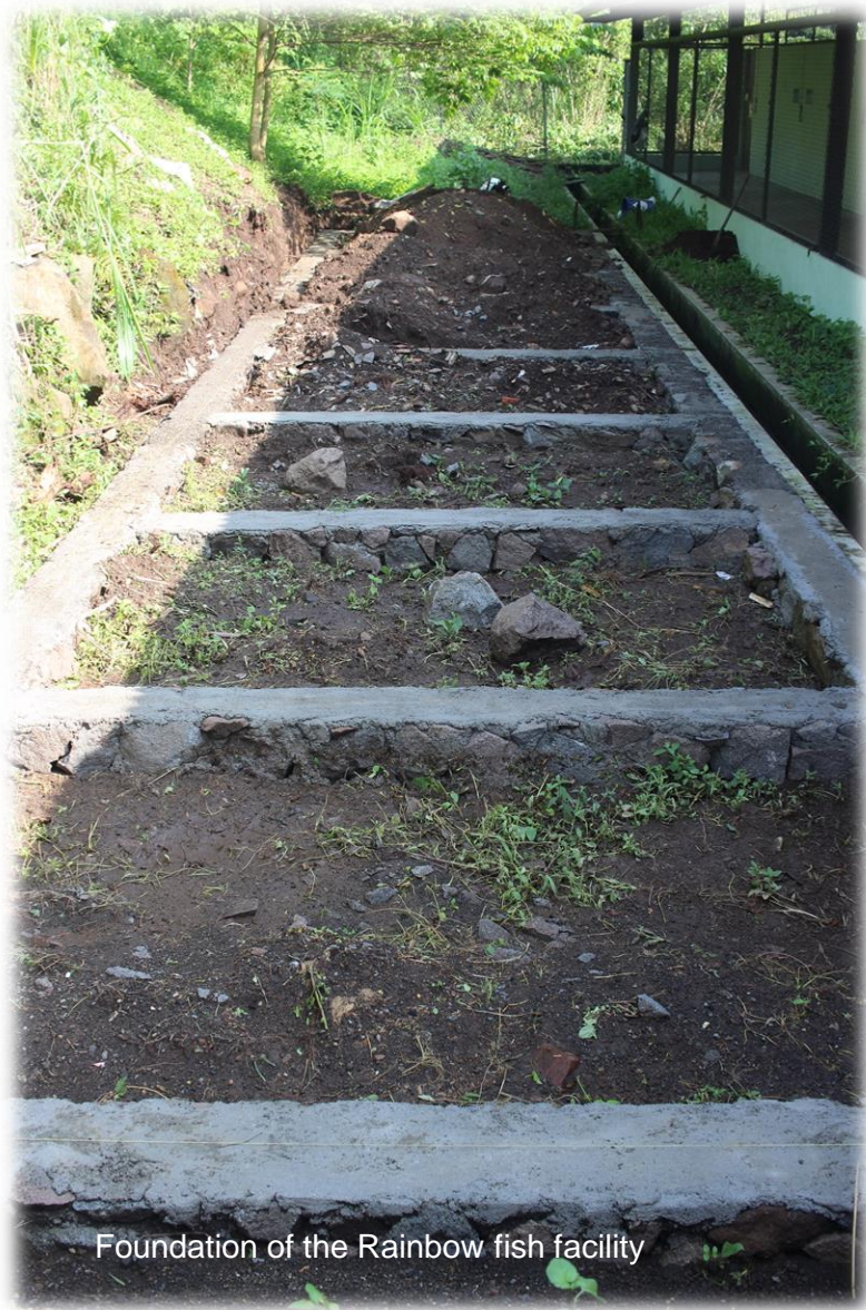
Foundation of the Rainbow fish facility