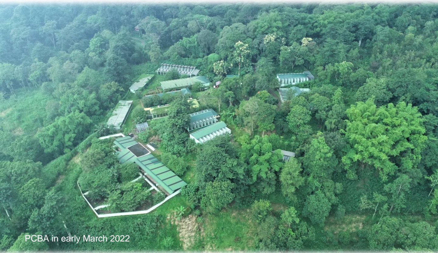
PCBA in early March 2022

With the International Galliformes Symposium in October, we will for the first time host a major international event. This will serve as an opportunity for us to introduce our pheasant conservation breeding efforts to international pheasant enthusiasts as well as conservation practitioners. At the same time will also be an opportunity for PCBA to be known for its extensive conservation breeding projects in general.