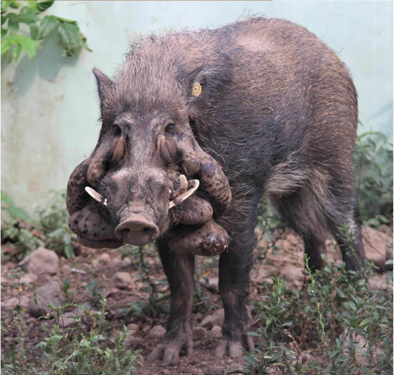
Javan Warty Pig ( Sus verrucosus )