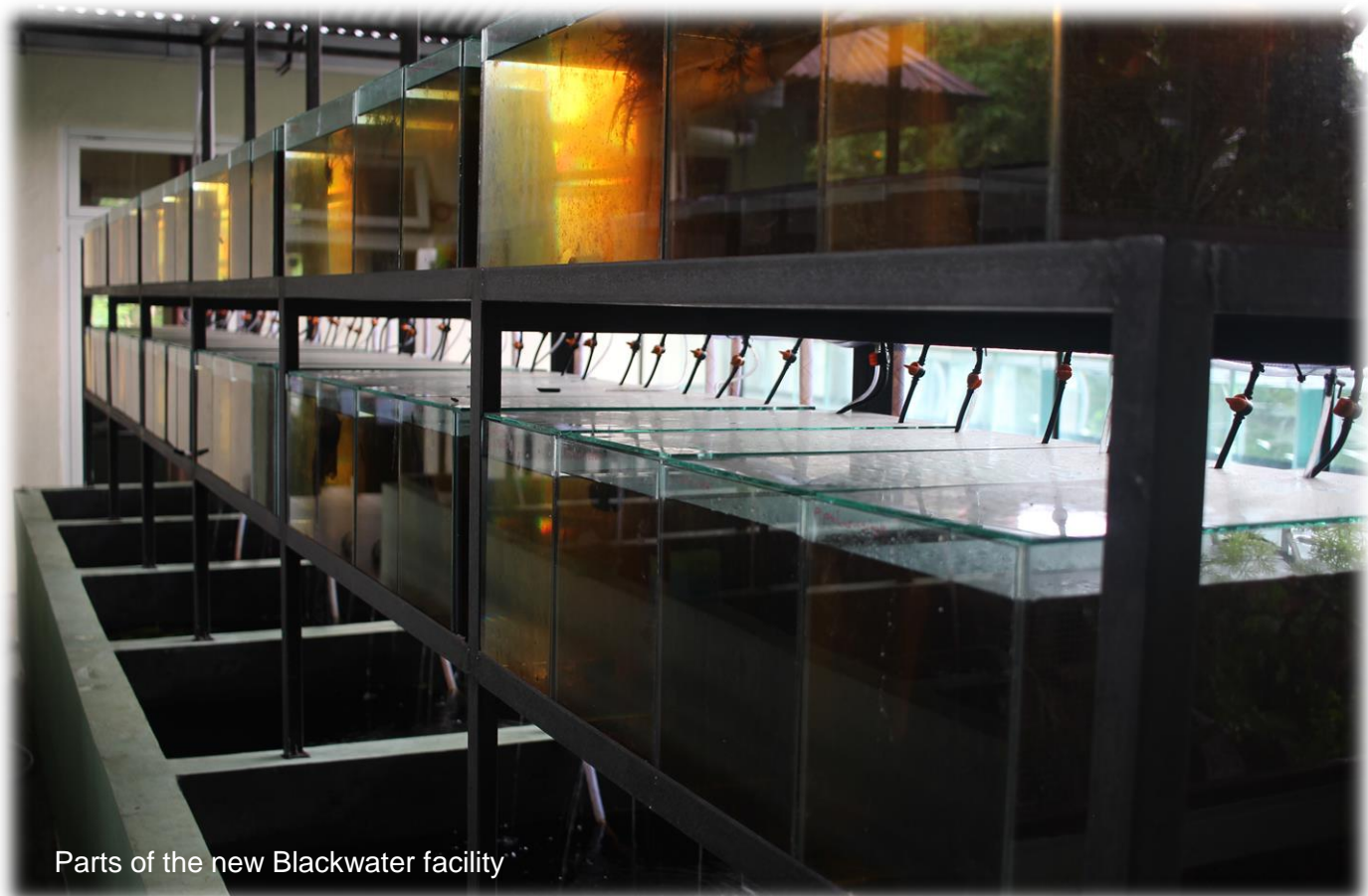
Parts of the new Blackwater facility

The larger facility comes with its very own challenges, especially the coated concrete tanks have been leaching minerals into the water which had to be overcome with extensive watering and regular water changes. By now the facility works smoothly and the water parameters have stabilized, enabling us to engage in intensive breeding efforts once again.