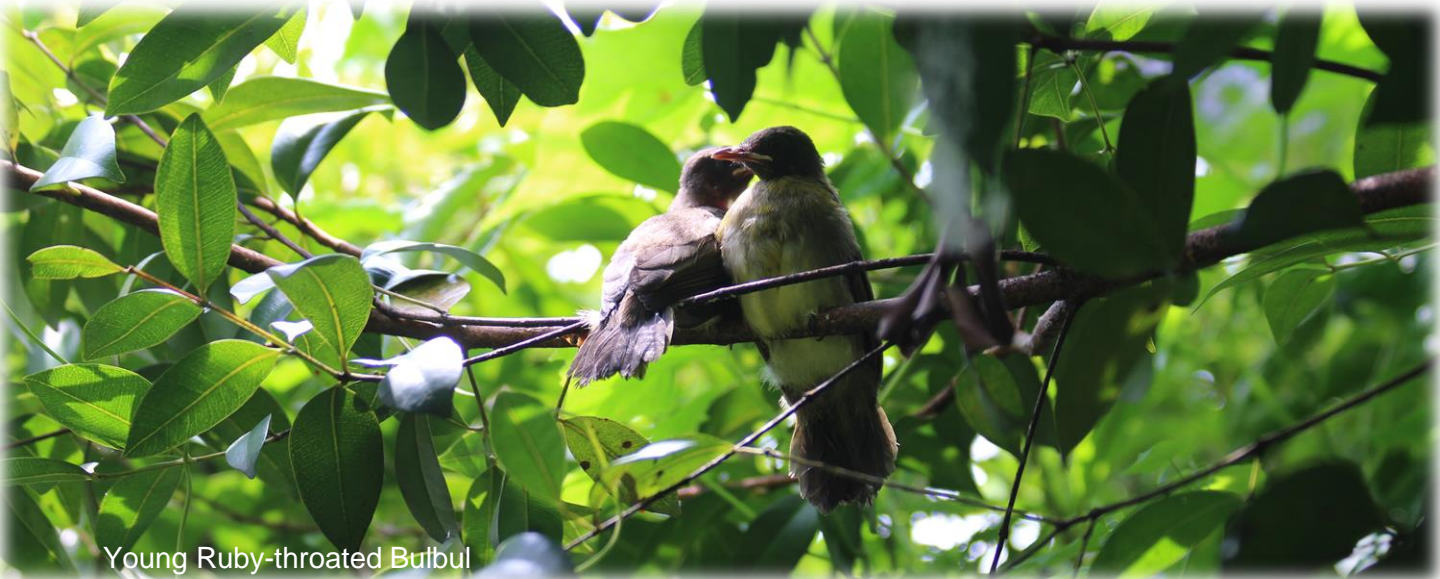
Young Ruby-throated Bulbul