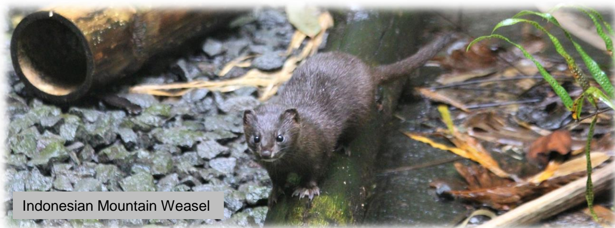
Indonesian Mountain Weasel

After decades of virtual absence of any kind of record, recently alarmingly high numbers of Mountain Weasels appear in the trade. This raises concerns, especially for the Javanese populations since all traded individuals seem to be sourced from Java.